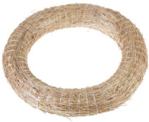
Straw wreath Ø 30 cm