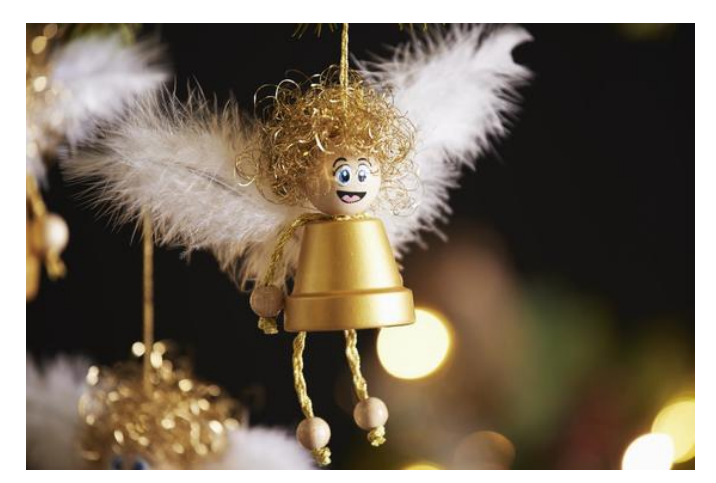
You will love this golden Christmas crafting fun!

Create beautiful angels for your Christmas decorations or as guardian angels for your loved ones. The cute angels are also great for children - fun for the whole family!