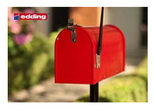
Here's how it works

Simply label and paint lantern foils with edding® pens and then create beautiful Lanterns! Let this idea from the house of edding® inspire you to make your own creations.