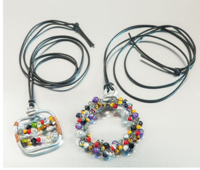
Wrap beads as you please!

Finally, thread a leather strap through the eyelet and knot the ends.