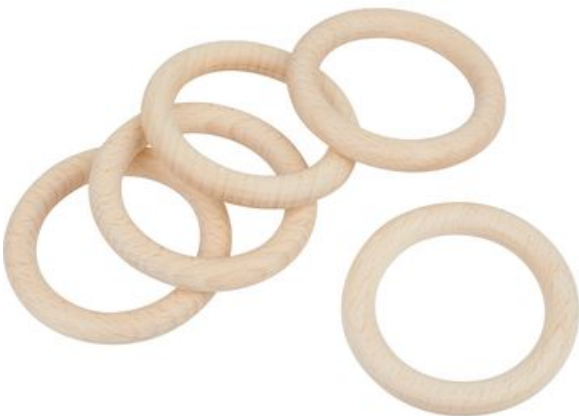
Wooden rings, Ø 70 mm, 5 pieces