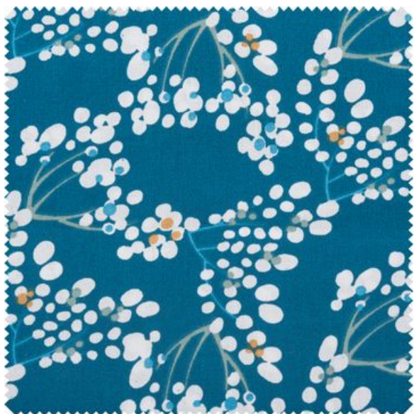
Cotton fabric "Lorena" Magique