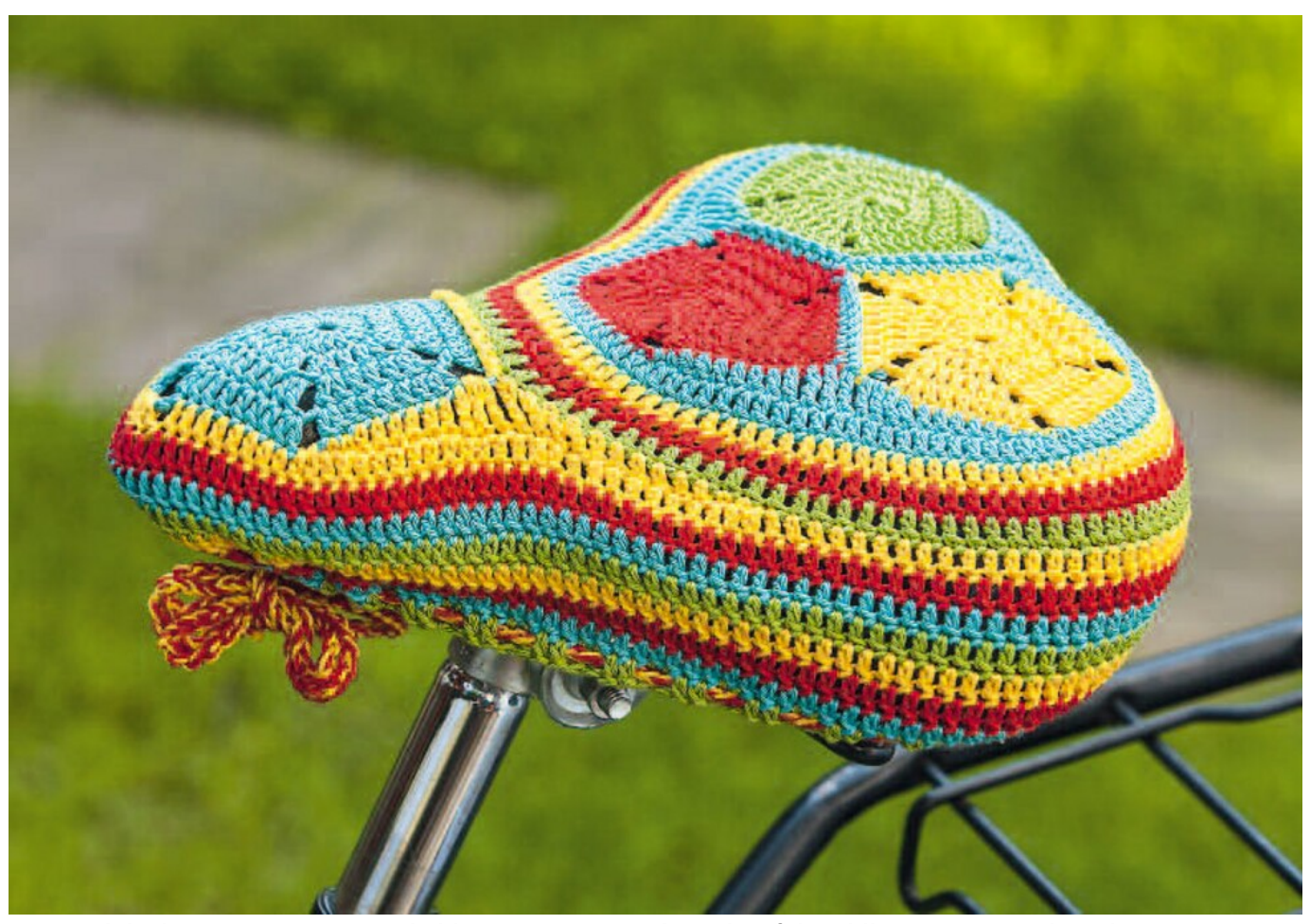
So your bike becomes an unmistakable unique piece: The colourful saddle cover is crocheted Cotton yarn and is individually adapted to your saddle while working. With this instruction you will surely succeed in crocheting.