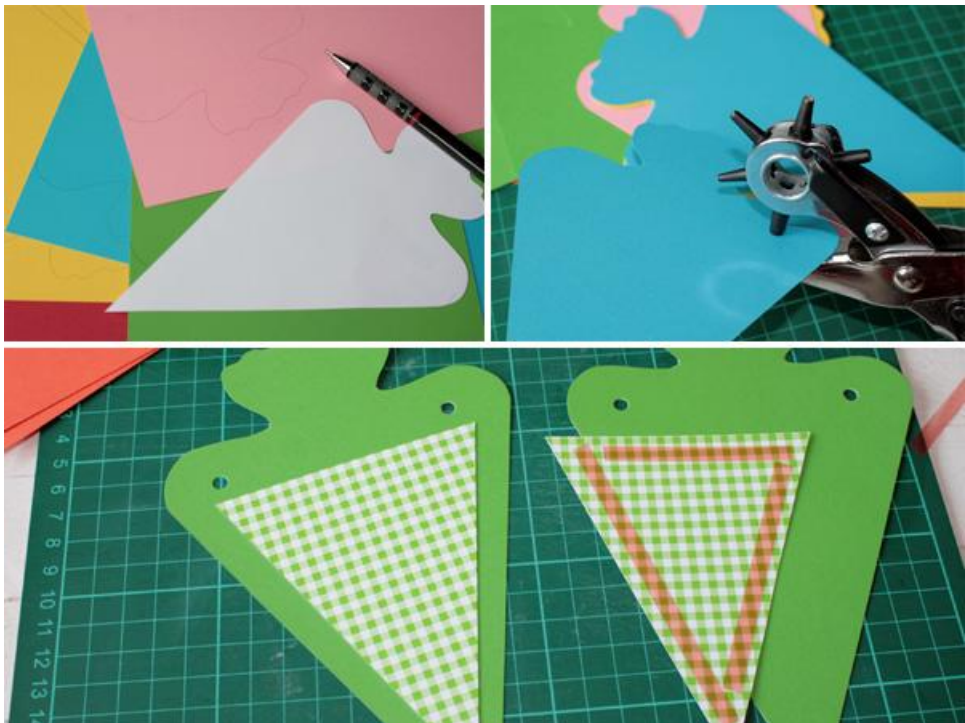
Now the pennants are ready for the big day!

For the bunting, transfer the large pennant template onto cardstock multiple times and cut it out. Punch out the holes for the hanging. Decorate the pennants with checkered triangles or write words like "First Day of School." String the finished pennants onto a ribbon. If necessary, you can secure them with tape to prevent them from sliding.