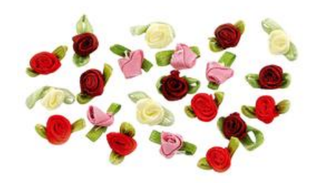
Little satin roses are a must-have on every wedding decoration. Decorate the heart and the silk doves with the little florets together with a mistletoe or with boxwood.

Some Article are unfortunately no longer available