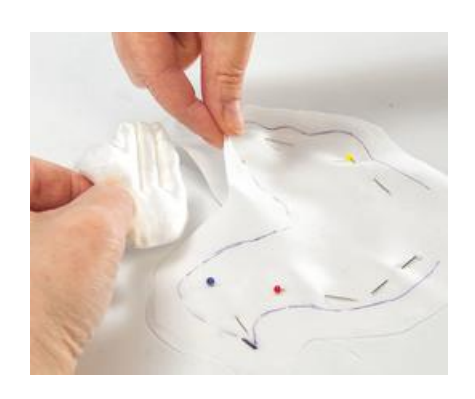
Fabric cuts of the silk pigeon sew together on the left side, turn it over, stuff it with filling cotton wool.

Write "just married" in the sheet with the line-ex pen and write "just married" with the Pearl Follow Pen. Glue an approx. 22 x 3 cm large firm cardboard centrally behind the heart. Then fix the pigeons on the right and left from heart on the cardboard. Finally, glue small mistletoe twigs or some boxwood from the garden to the heart and place small satin bows on top.