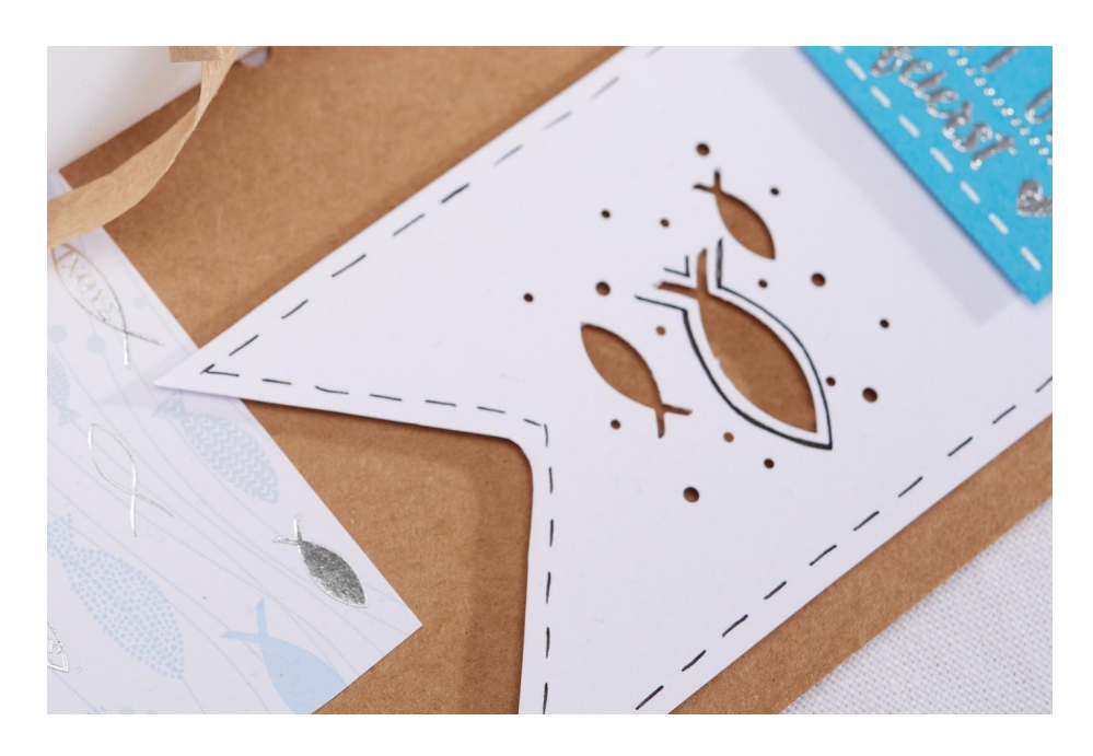
Small Accessories for Unique Card Design

Use <u>punches</u> for interesting effects. Also, <u>embossing and die-cutting machines</u> help to create professional cards.