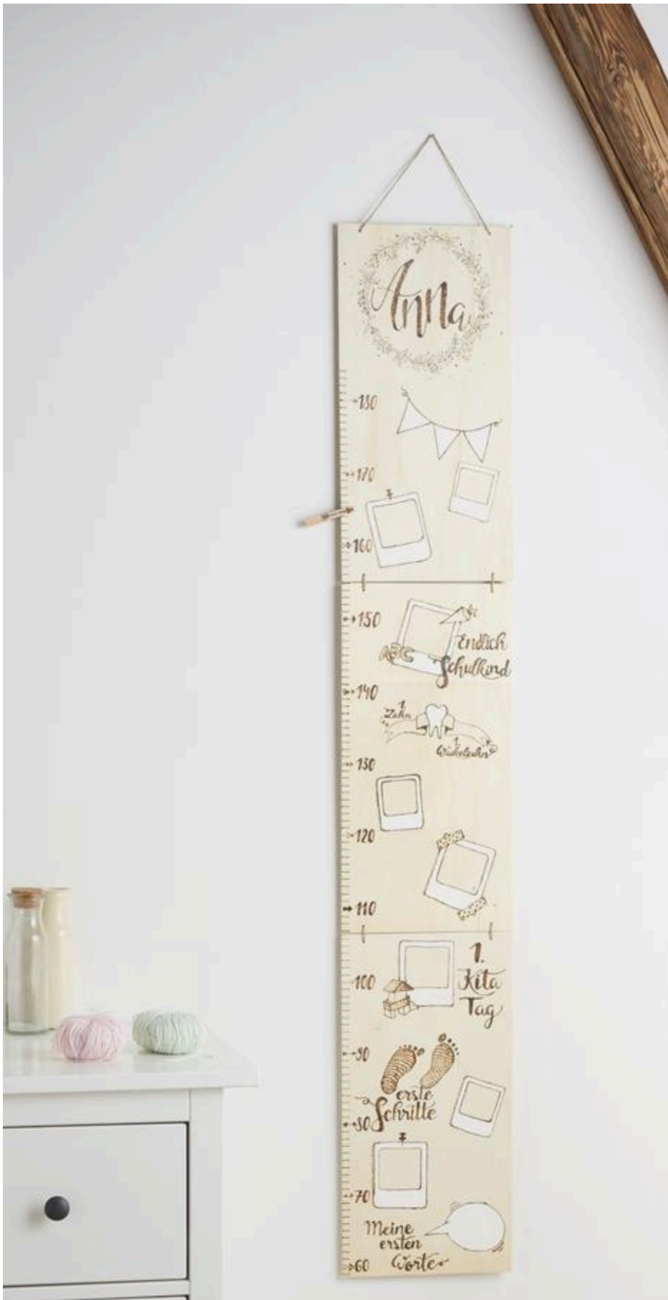
The yardstick in the raw version: