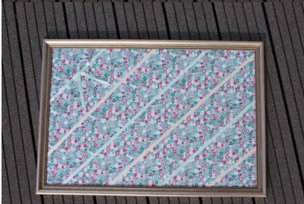
Step 6 - Attach the decorative bow

Decorate the entire construction with a small bow at any point for the finishing touch.