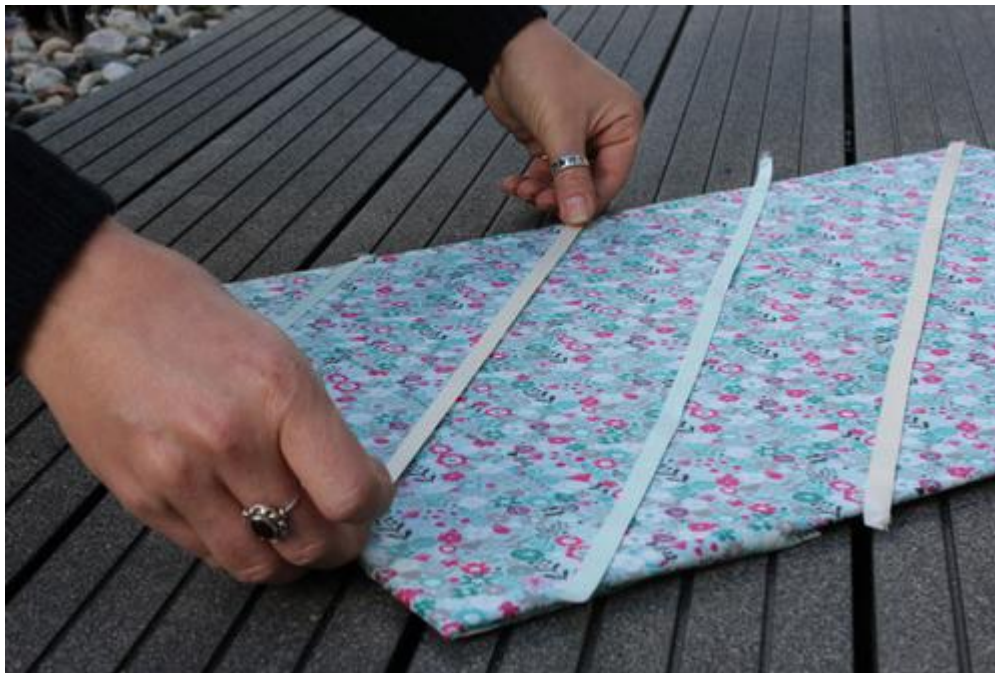
Step 5 - Assemble the frame and back panel