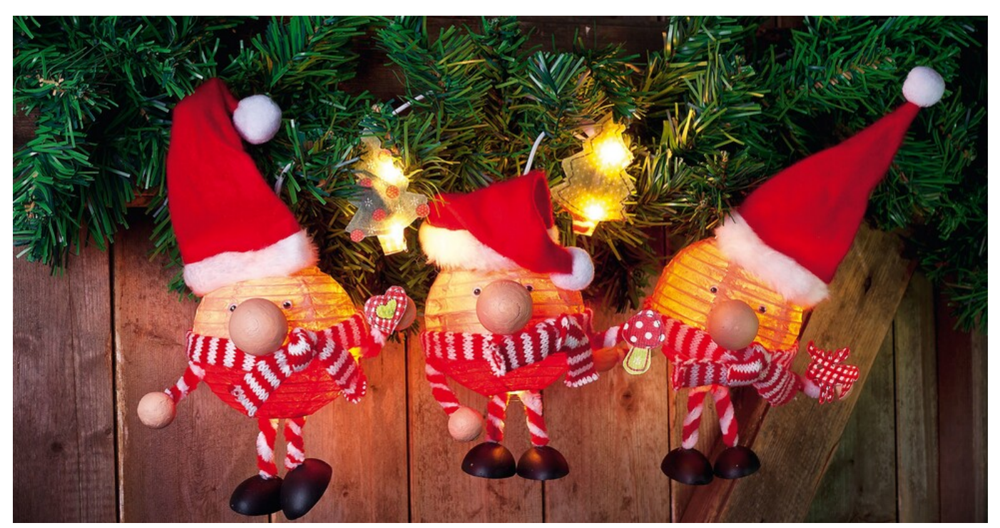
Here's how it works

Glowing Santa Clauses make for a wonderful Advent season. The pretty fairy lights are not an optical highlight in the only house. Why not decorate your garden or terrace and provide a warm light during the dark season.