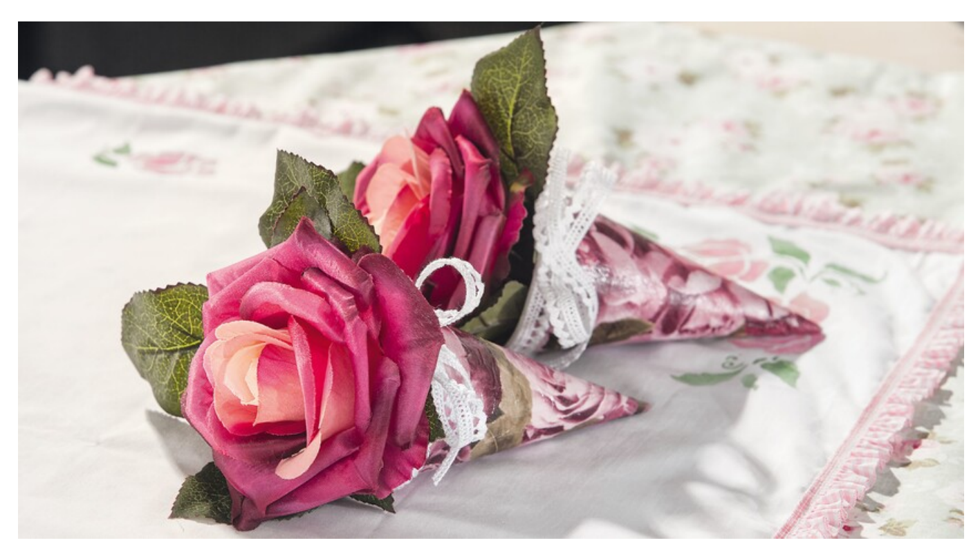
Here's how it works

Quickly made is this classic romantic table decoration, which enhances every festively set table enormously. And the rose bags are also a distinctive decoration in themselves, which fits well anywhere.