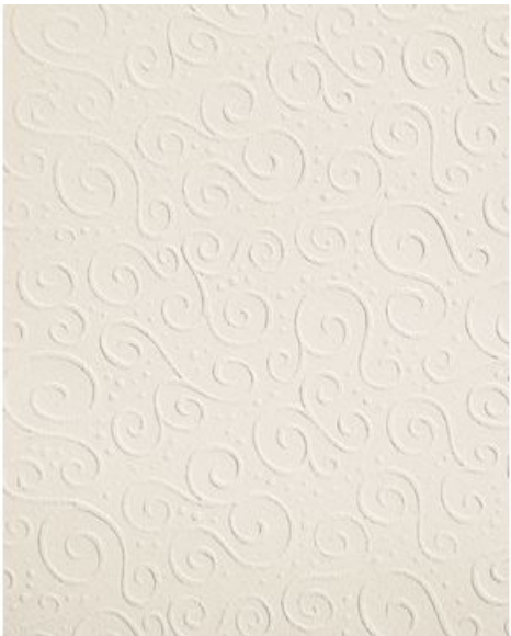
Embossed cardboard Milan, approx. 50 x 70 cm, 220 g/sqm, Champagne