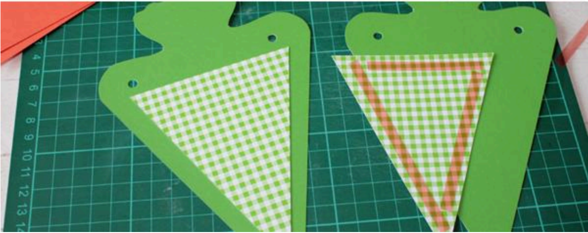
Now the bunting is finished and ready for the big day!