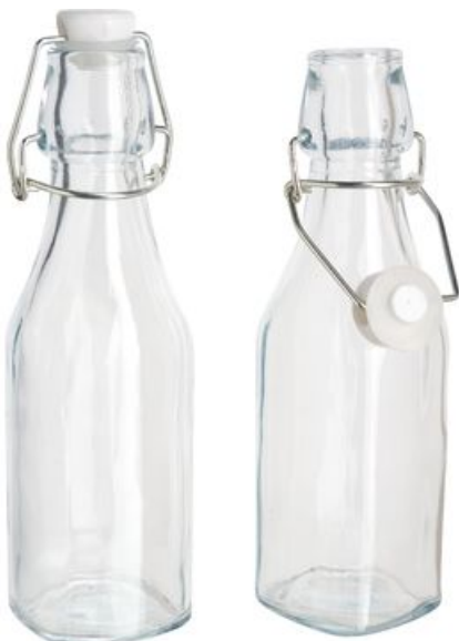
VBS Glass bottles with swing top 2 pieces