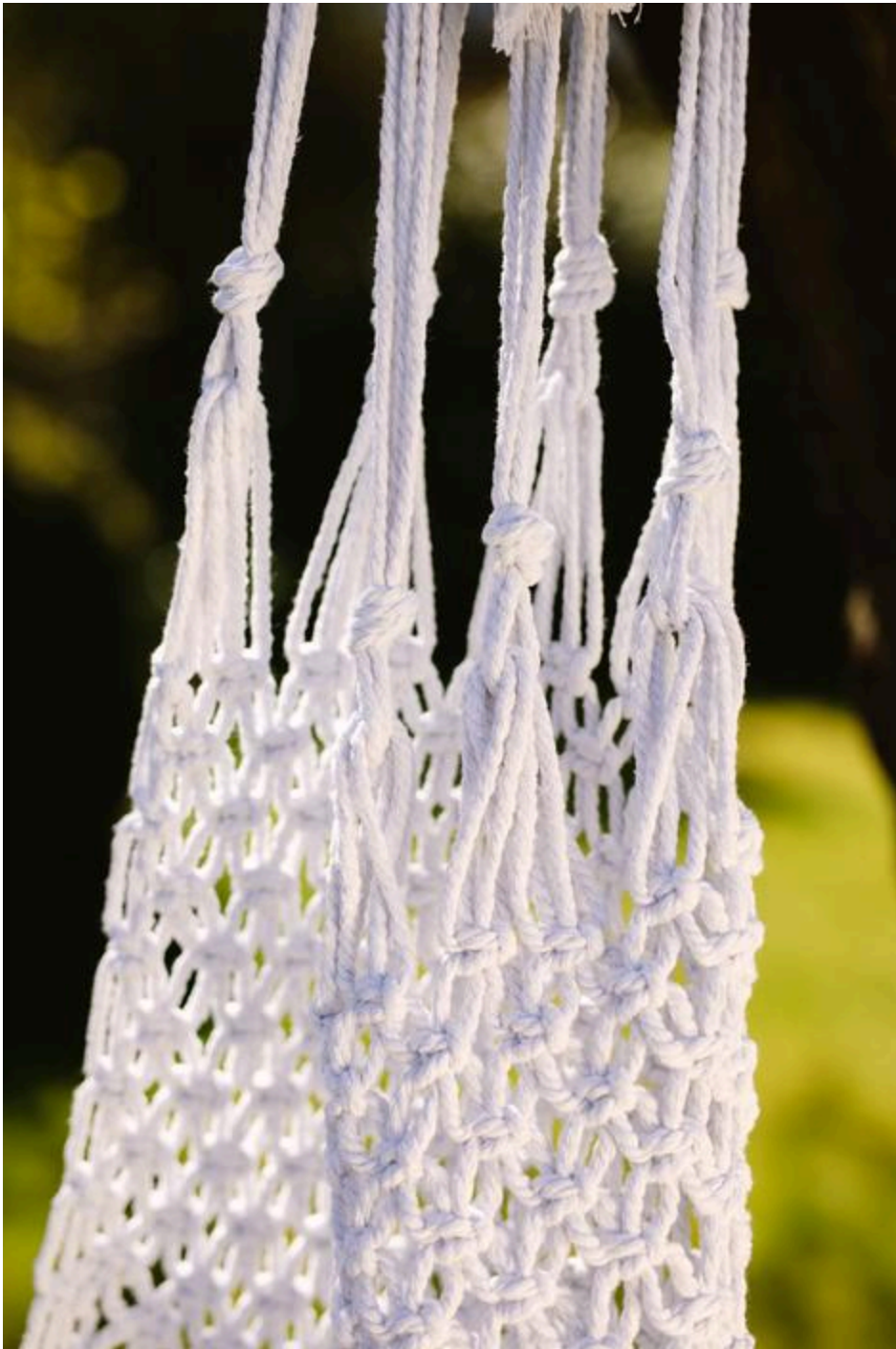
Knot suspension cords on macramé piece