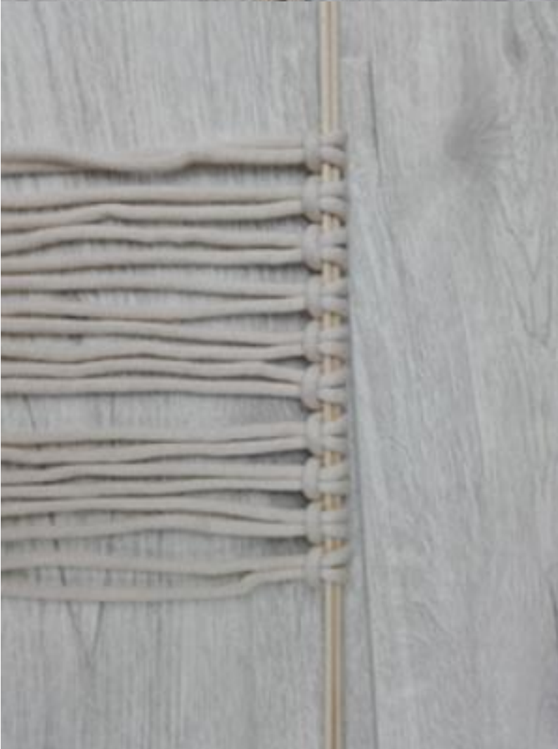
Step 1: The "basic knot"