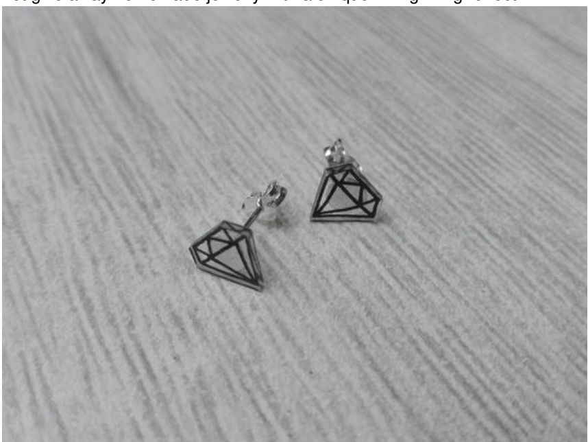
Step 1: Draw Your Design

It's also a great option as a gift for your loved ones. Jewelry is a timelessgift for Christmas that is sure to bring joy. So why not give away homemade jewelry with a unique "Bling Bling" effect?