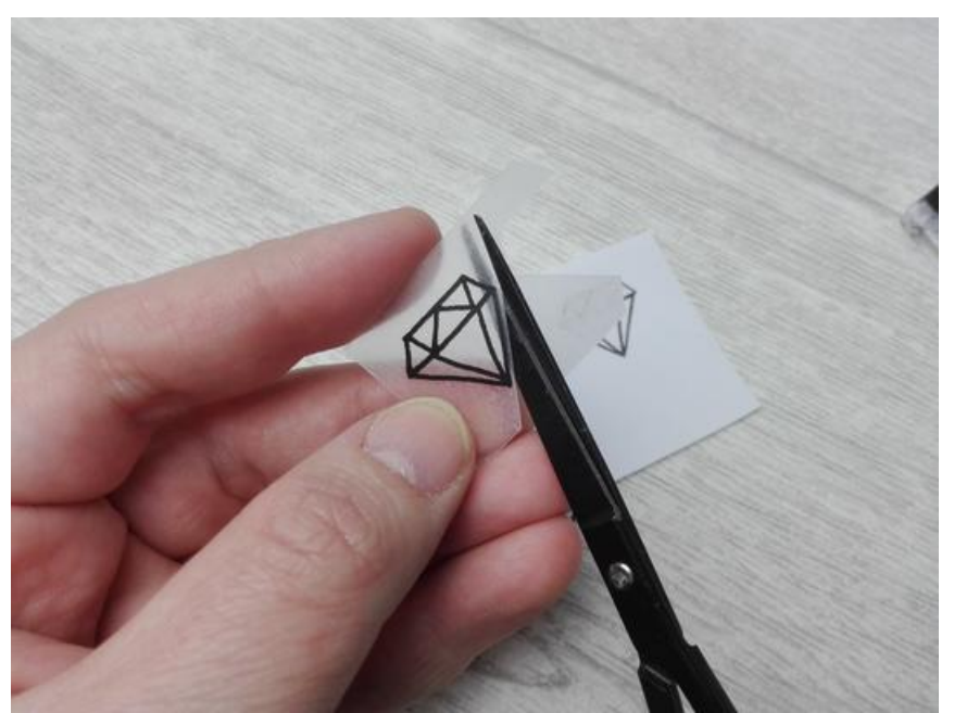
Step 3: Shrink

Preheat the oven to 120°C and use top/bottom heat. Place the cut diamonds with the rough, painted side up on a baking sheet lined with parchment paper. The shrinking process takes about two minutes. Don't worry if the plastic curls – that's normal. Once it lays flat, you can remove the finished pieces from the oven. They will now be about half the size, with more intense lines and considerably sturdier.