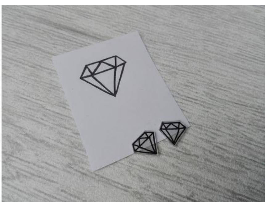
Step 4: Glue

Now for the final touches: Glue the shrunk diamonds onto the sterling silver earring posts. A special jewelry adhesive is best suited for this. Ensure that you allow the glued areas to dry thoroughly. Your handmade earrings are ready! They are perfect as gifts for friends and family, or as a pretty accessory for yourself.