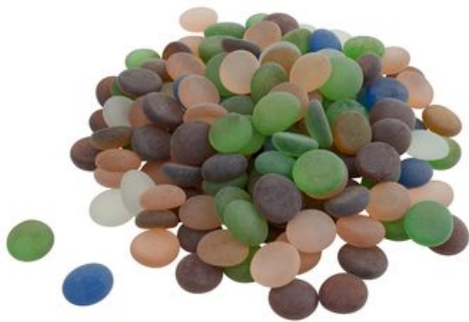
VBS Glass muggle stones "Colorful Opaque", 1 kg, Ø 1,8 cm