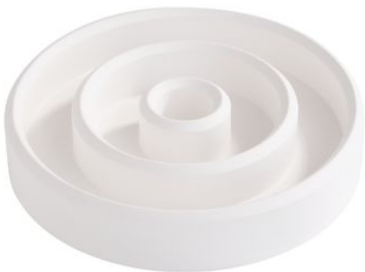
Silicone casting mould "Stick candle holder Chic"