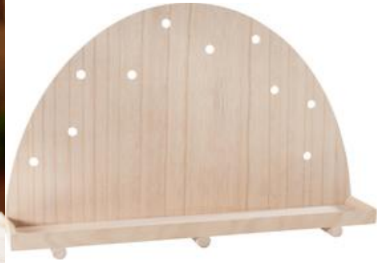
Craft idea with VBS light arch for 10s chain of light