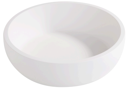
Casting idea combined with napkin technique