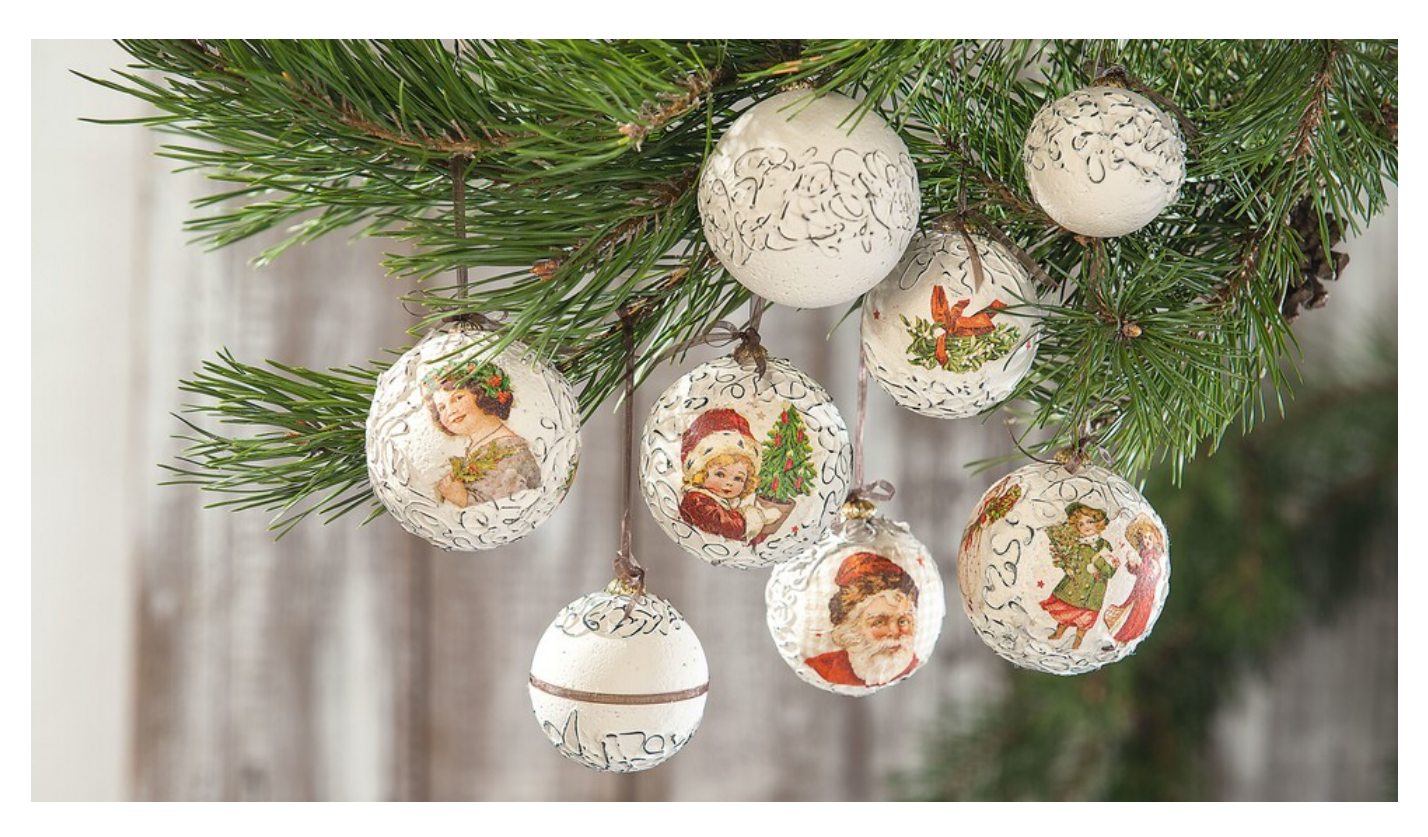
Here's how it works

The nostalgic napkin motifs are perfect for creating Christmas tree balls. The decorative snow liner provides a beautiful plastic structure on the Christmas Balls.