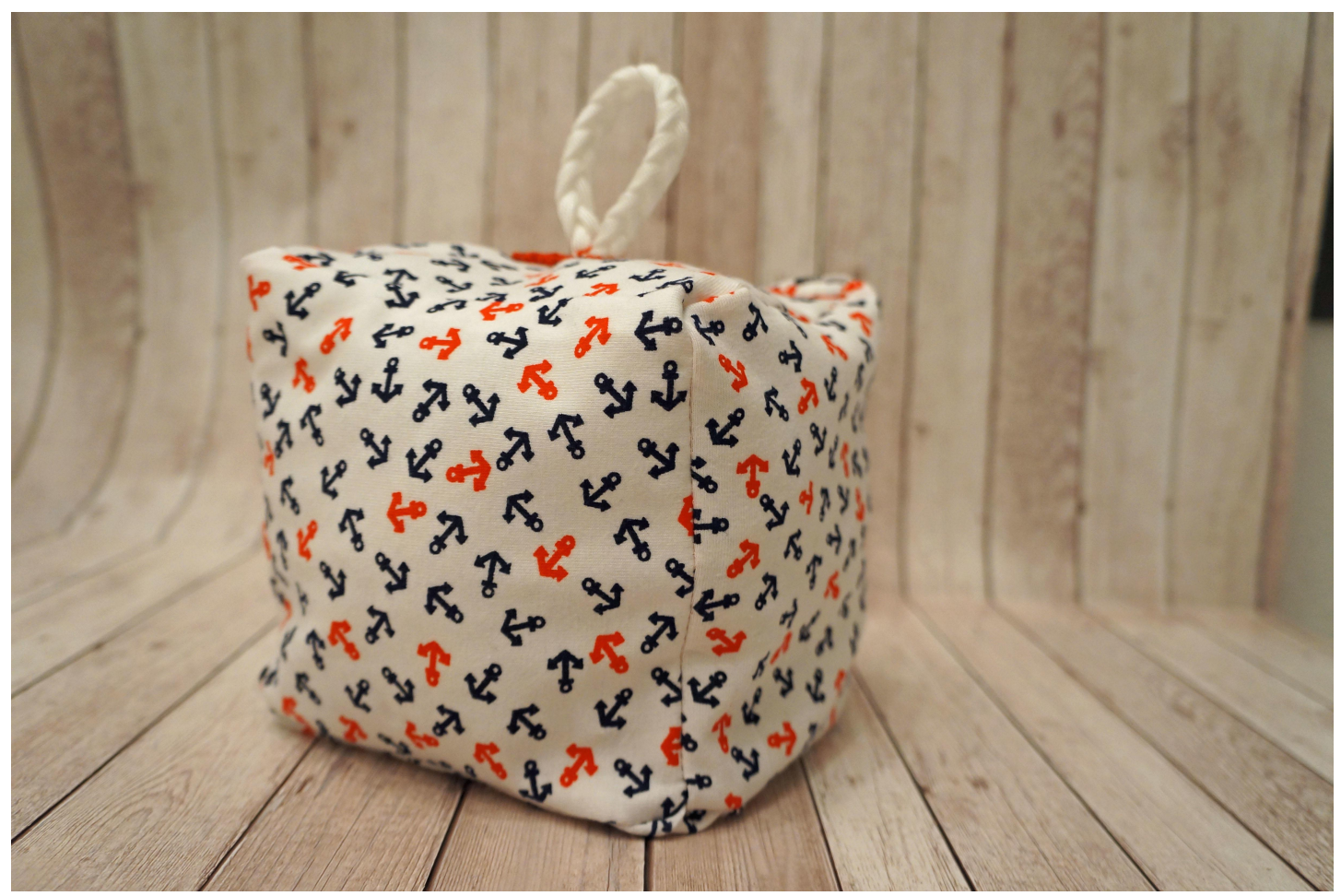
Creative Doorstop: DIY Sewing Guide

Are you tired of using boring, silver-colored metal doorstops? Do you want to give your home a personal touch? Then you're in the right place! In this guide, I'll show you how to sew a stylish, nautical-themed doorstop yourself. It's simple, using some fabric, sand, and your creative flair.