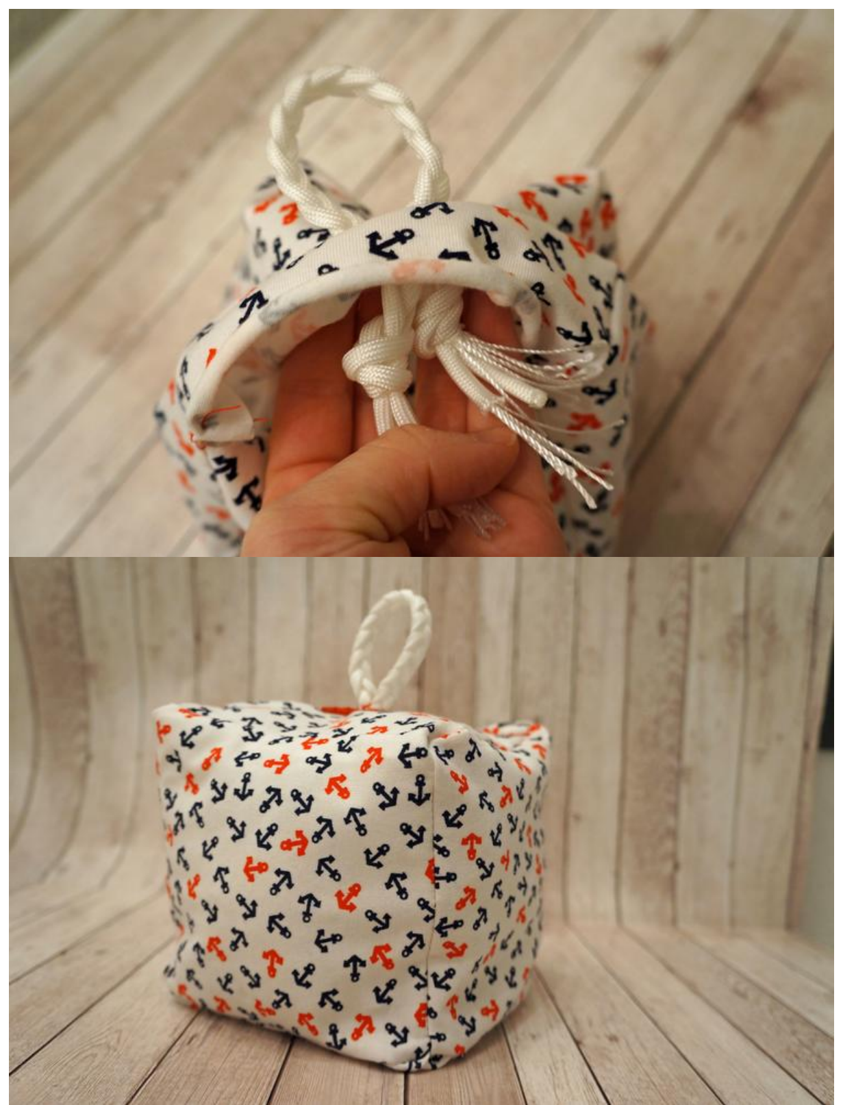
Enjoy this creative sewing project!

Discover our broad range of sewing materials in our online shop and start your own doorstop project right away! Your creativity knows no bounds!