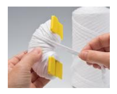
This idea is timelessly beautiful!

Some Article are unfortunately no longer available