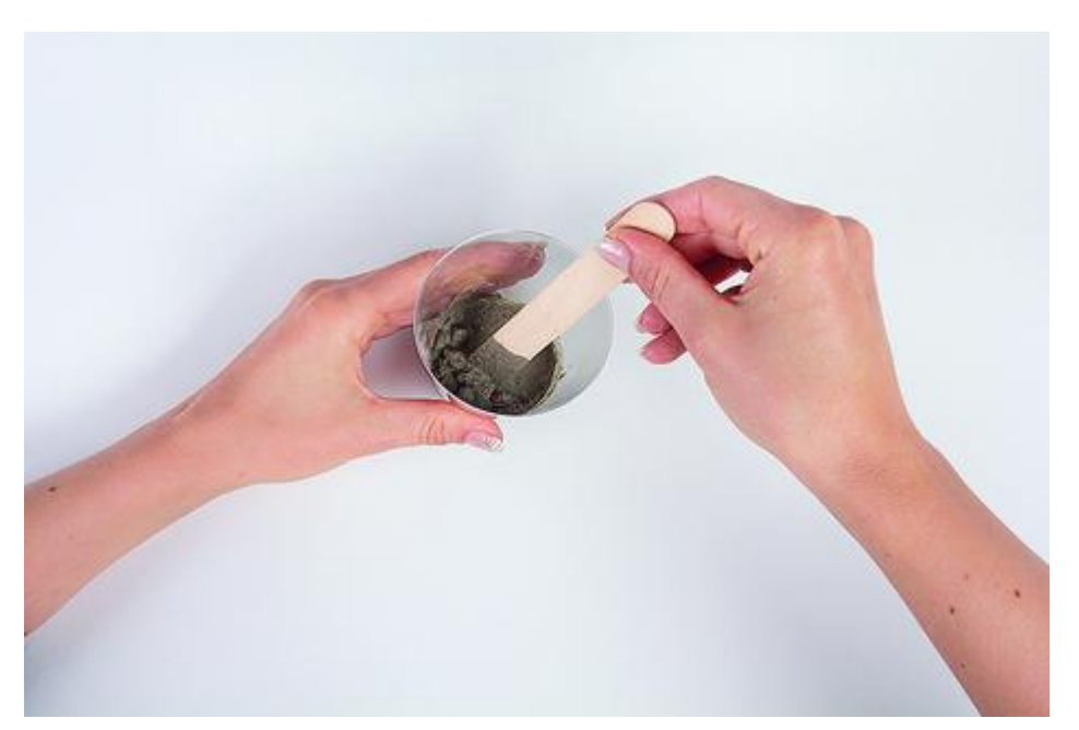
Casting compound touch,...