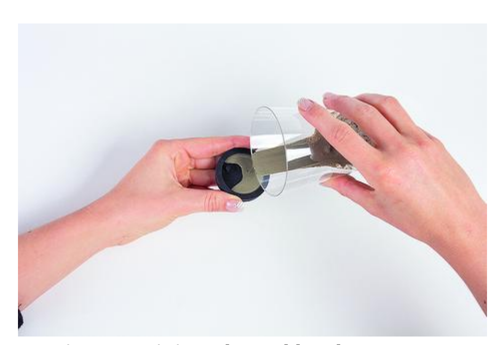
... ...just pour it into the mold and...