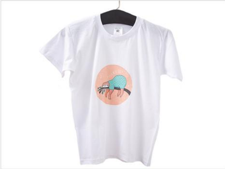
T-Shirt with Napkin