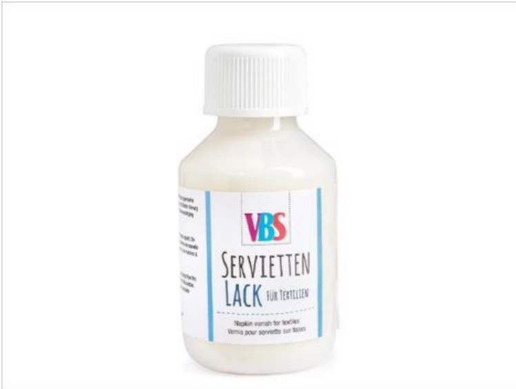
Napkin varnish Textiles

Important: If you are Napkin technique working with thin fabrics such as T-shirts or cotton bags, place one or the Handicraft mat like between the layers of fabric. Otherwise it can happen that the two layers will stick together.