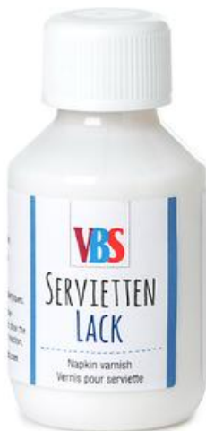
Napkin varnish Glossy