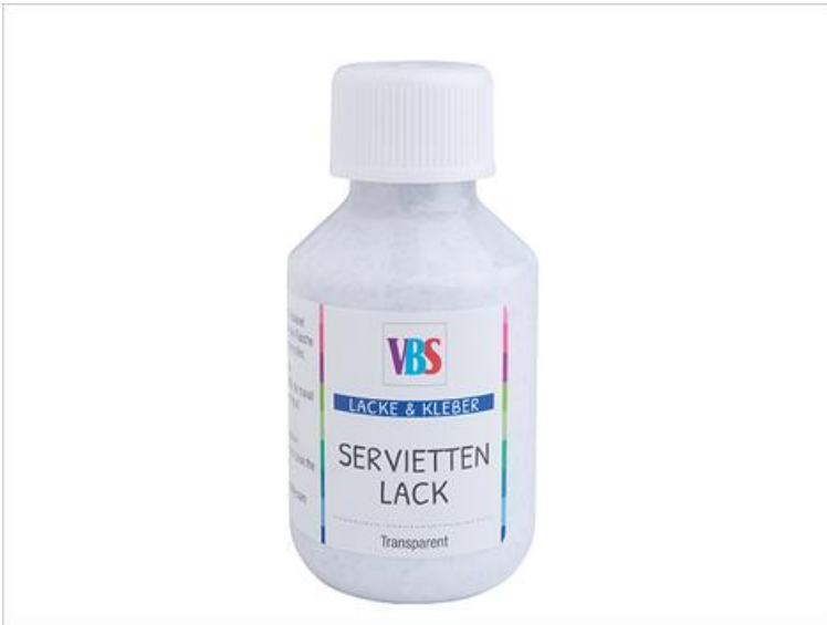
Napkin varnish Mica

The universally popular technique also works on textiles. First of all, cover the work surface with newspaper or one to avoid Handicraft mat contamination. As usual, choose a Napkin cut out the motifs and remove the unprinted layers. Now apply the special one Napkin varnish for textiles directly on the fabric, place the motif carefully with a soft brush and apply the again. Napkin varnish Make sure that the lacquer is applied right up to the corners and edges of the motif. The garment is simply ironed to fix it in place. Caution: Place baking paper between the fabric and the iron. Iron at level 3 until the glue and fabric are fused together. The fabric can then be washed at 30°C on a delicate cycle.