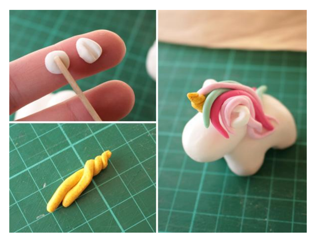
Finally, it's time for the tail. You'll need three equally long and thick strands, which you twist into a thick strand. Thin the ends slightly and attach the tail to the back of the unicorn.