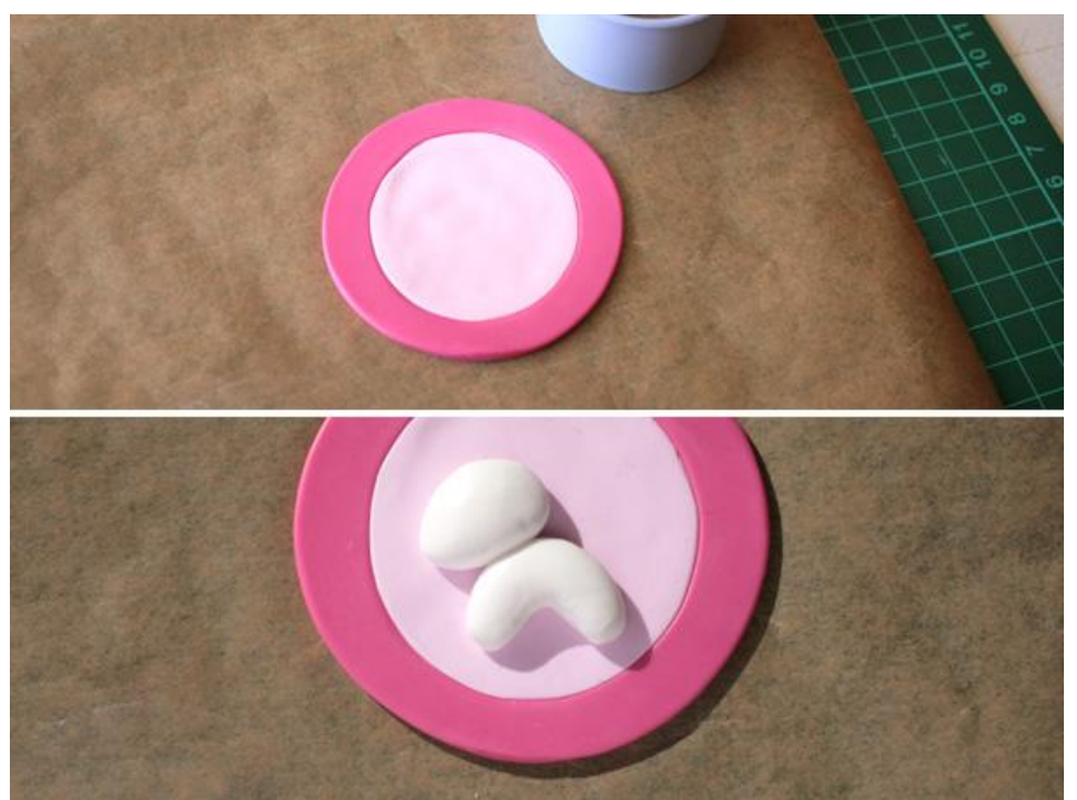
Create the head and body of the unicorn and place both on the lower third of the modeled circular surface. For the mane and tail, shape small thin strands of dark pink FIMO, thinning the ends and then rolling them up on one side. Shape the ears and horn as described in this guide for the 3D unicorn, and attach them to the unicorn. You may then adjust the mane a little around the ear. You can easily indicate the eye with a toothpick.