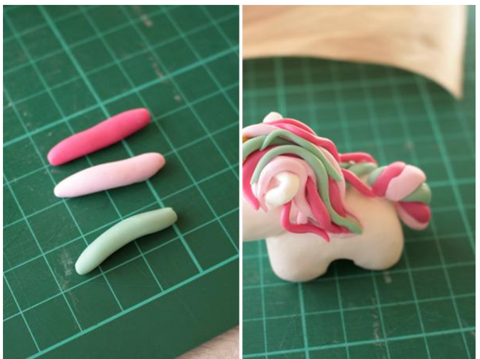
Bake your unicorn at 110°C (230°F) for about 20 minutes. After cooling, give it cute eyes with a black marker.