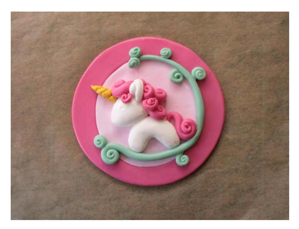
This unicorn also bakes for about 20 minutes at 110°C (230°F) in the oven. If you want, you can draw the eye with a black marker after cooling.