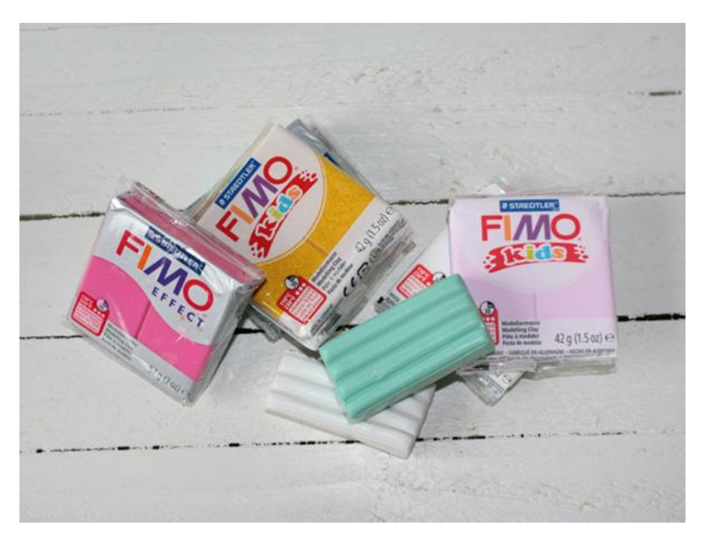
Step 1: Create your 3D unicorn

Start with the body of your 3D unicorn. Take a larger piece of white Fimo and shape it into the unicorn's body. Press the Fimo over your little finger until a sort of bridge forms and cut this area with a knife to later shape the legs. Once the body is standing, form the head and attach it by pressing it in place.