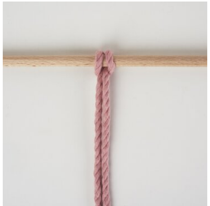
Lark's head knot backwards