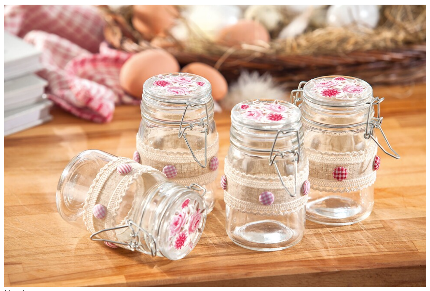
Here's how it works

These storage jars can be quickly and easily decorated to your personal taste. With a little Lace ribbon wrapping and small accessories such as buttons or Motif straw silk the simple glasses get their special charm.