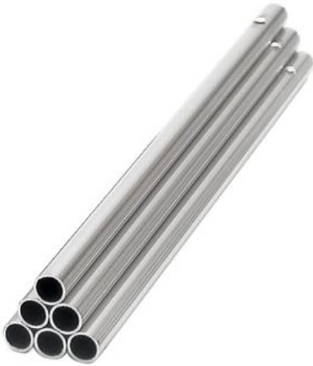
Sound bars "Hollow", 6 pieces, Silver color