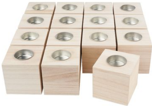
VBS Tealight holder "Cube", 15 pieces