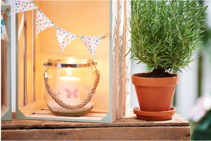
wind light with transfer motif

Decorate the wind light lantern with decorative butterflies from a decorative butterfly napkin: To do this, cut out the butterflies, carefully remove all the bottom layers of paper so that you only still have the printed paper layer. Position these on the wind light and stick them on using napkin varnish . Apply as little varnish as possible over the motif on the glass. you can scrape away any excess paint with a bamboo skewer or carefully remove it with a universal cleaner.