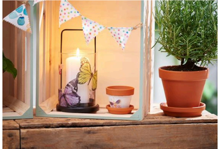
napkin technique on glass