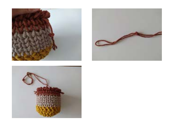
Cut a 2m cord and tie it in the pot.

You can use it as an hanging pot by adding an extra cord to it: