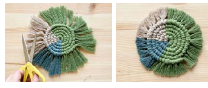
And you have finished your coaster!

• Finally, cut the fringes in a circular way.